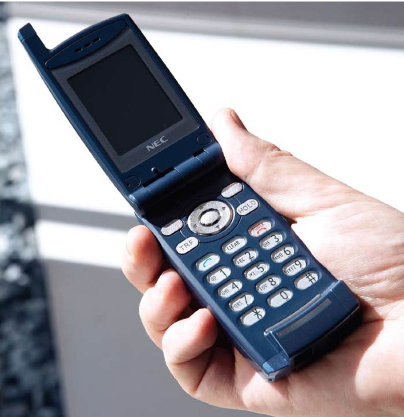
UNIVERGE MH250 phone