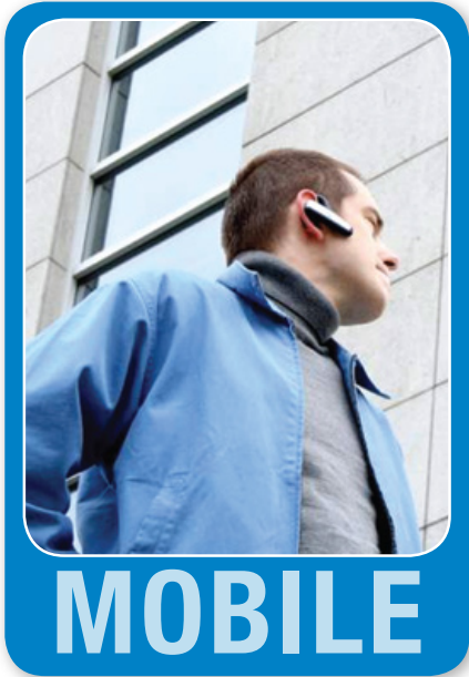
Anytime. Anywhere. Important messages are only a quick connection away with CallXpress. You can even listen to your e-mail messages and respond by voice.

For even greater productivity, all of your messages—voice, fax and e-mail—appear in your Microsoft Outlook®, Lotus® Notes®, Novell® GroupWise®, Mirapoint® or other IMAP4-compatible e-mail inbox. Messages can be prioritized easily and accessed in any order. No longer will you have to dig through all your voice messages just to get to the important ones.